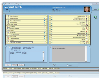
2. With one touch, data is instantly synchronized to appropriate folders within the chart.